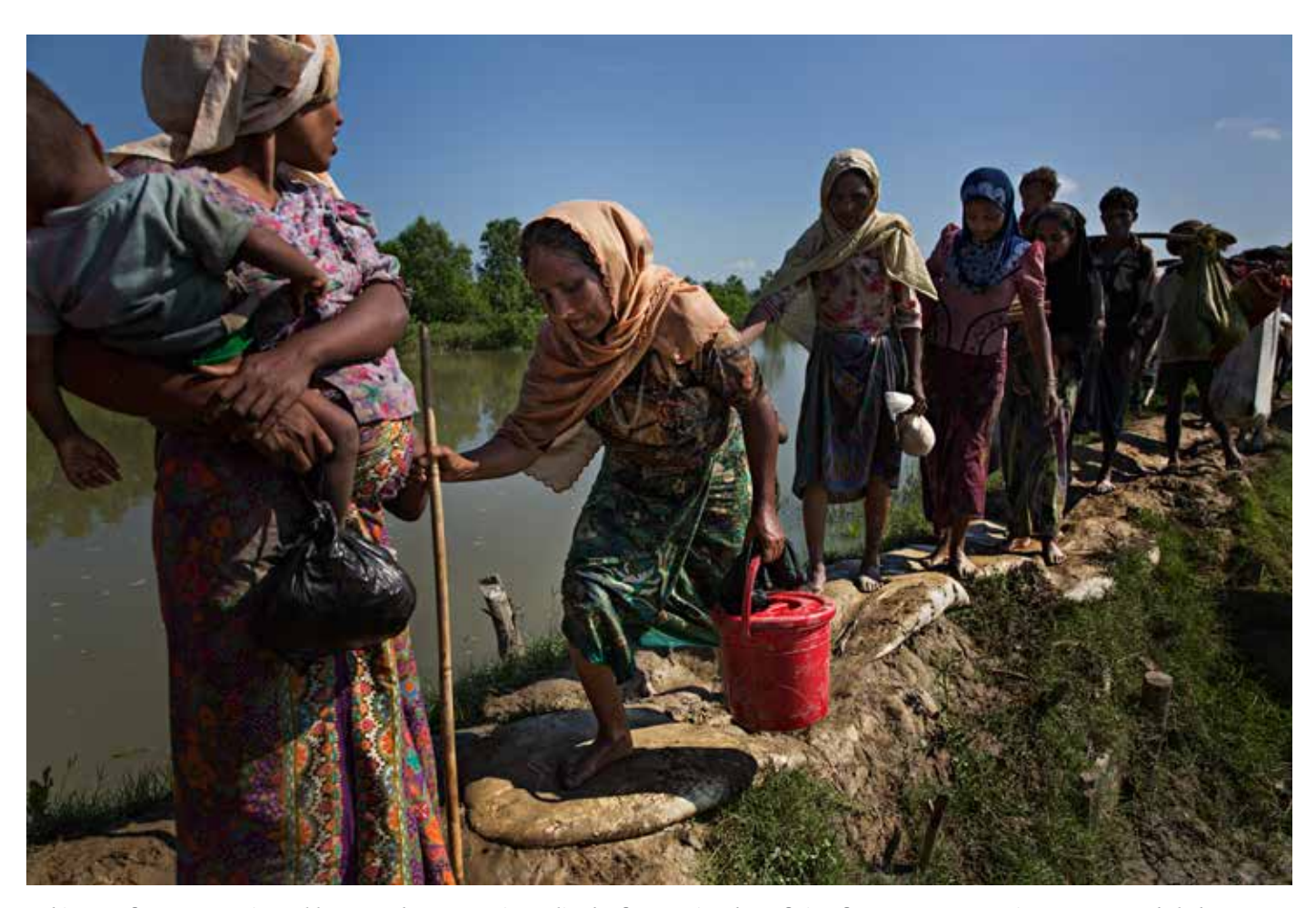
Rohingya refugees cross a rice paddy on October 16, 2017, immediately after crossing the Naf River from Myanmar to Anjumanpara, Bangladesh.

In response to an October 21, 2016, communication to the Government of Myanmar from five UN special rapporteurs about "alleged human rights violations occurring in relation to recent attacks on 9 October 2016 in northern Rakhine State," the Government of Myanmar denied allegations of summary executions, arbitrary detention, and mass graves, stating, "There is no evidence revealed to date to support the allegations of mass graves filled with persons killed during the operations." In response to allegations of rape, the government cited Commander-in-Chief Senior General Min Aung Hlaing in its claim that "there were no murder or rape cases according to the reports on the ground." 114