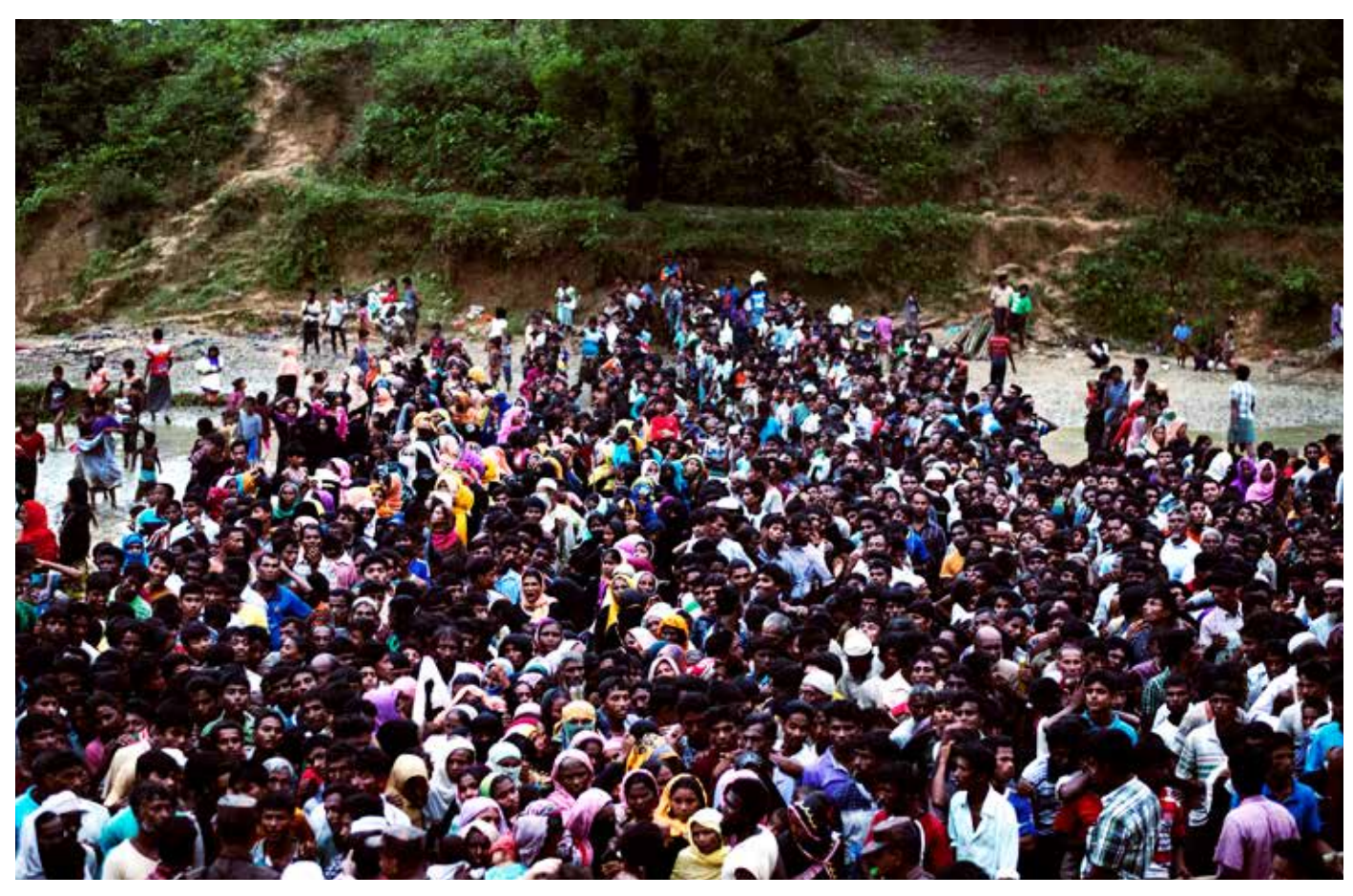
More than 1,000 Rohingya congregate around a truck filled with private donations of rice. The surge of Rohingya into Bangladesh has caused a humanitarian crisis, with desperate refugees completely reliant on humanitarian assistance.

Various international institutions and other governments are well placed to press the Myanmar authorities to make effective progress on the items listed above.