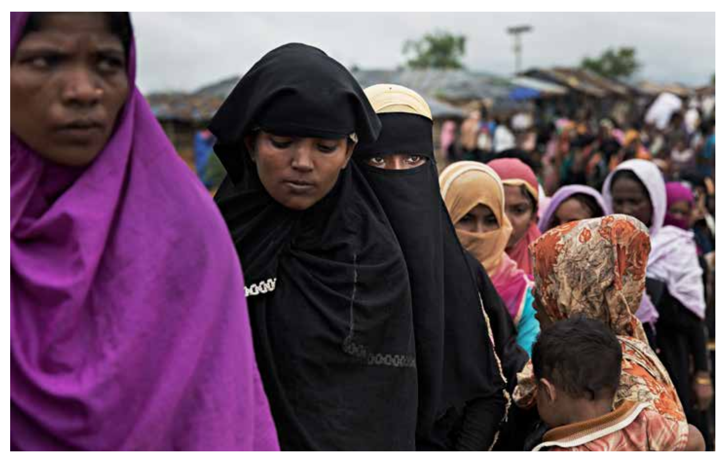
Rohingya refugees wait in a food distribution line in Kutapalong refugee camp, Cox's Bazar, Bangladesh, on October 12, 2017.

six women three times. They took them to the bushes of the bank. And then they came again and took six more. I couldn't see what happened to them but the women never came back. I believe they were raped and killed. 55