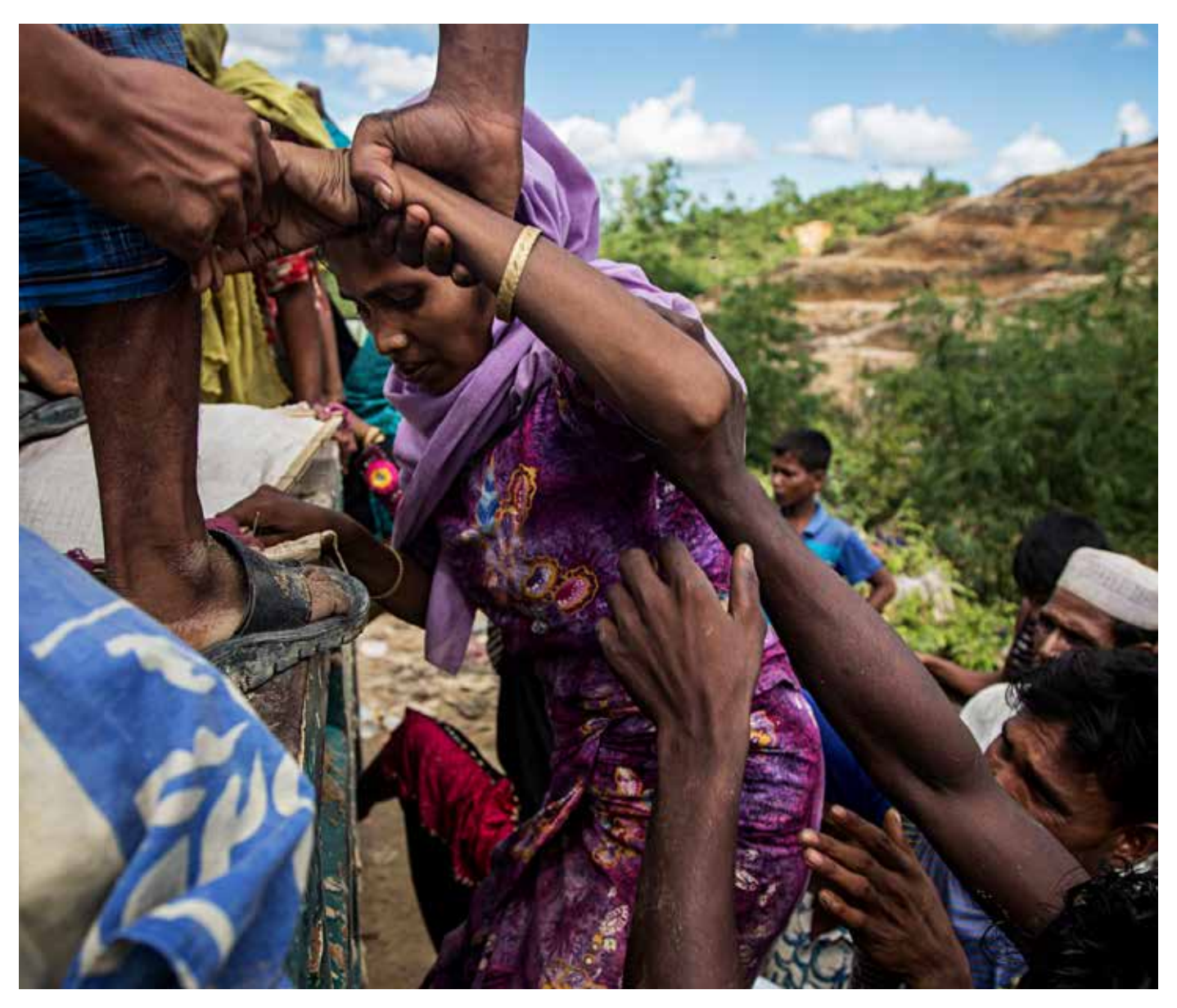
Rohingya board a military vehicle for transport to a refugee camp near Cox's Bazar, Bangladesh, on October 14, 2017.

In the span of one year, ARSA demonstrated its ability to recruit willing "fighters," attack government installations, and commit human rights violations against civilians, including murder. The Myanmar authorities have used the advent of ARSA to attack Rohingya civilians and shape