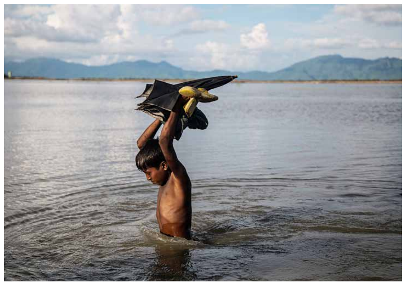
A young Rohingya boy carries some of his belongings on October 13, 2017, the morning after he arrived in Bangladesh by boat.