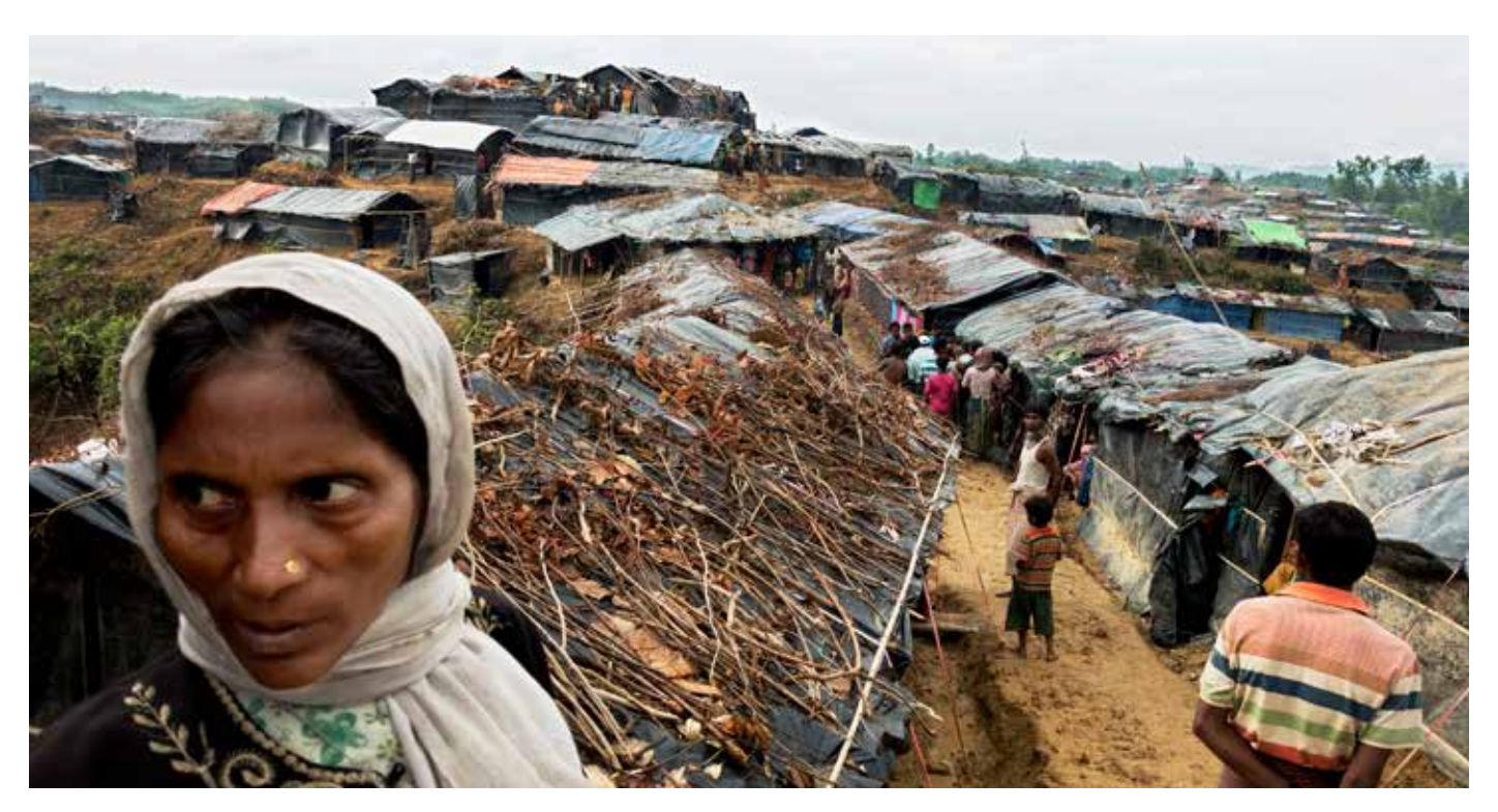
Makeshift refugee sites, like this one in Balukali, cover the hillsides in southern Bangladesh. Many Rohingya are sheltering in primitive huts like these, which are made of bamboo and plastic sheeting.

locations along the Naf River—which separates Myanmar and Bangladesh—refugee camps in Bangladesh, forested enclaves on the border, and villages where Rohingya survivors sought refuge. This report is based on more than 200 in-depth, in-person interviews—documented primarily by Fortify Rights—with Rohingya survivors and eyewitnesses of atrocity crimes, including more than 100 Rohingya women, as well as aid workers.