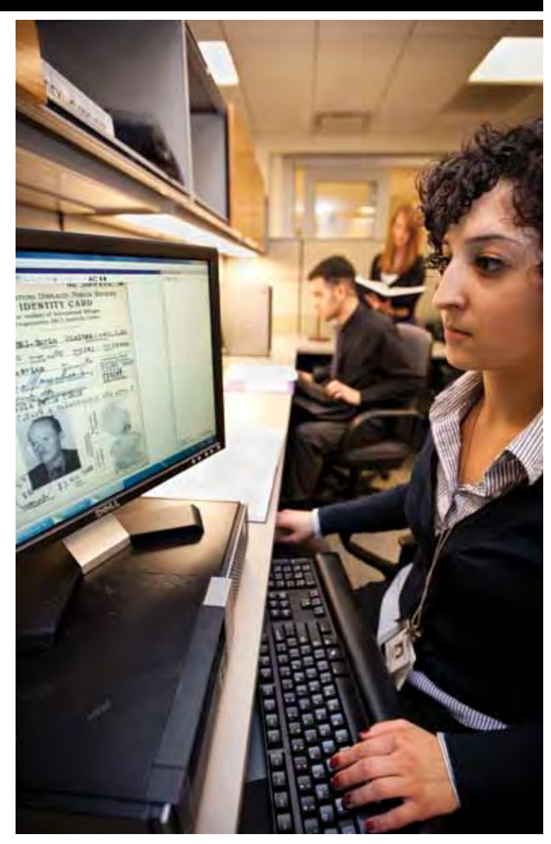
Museum staff search digitized historical records to assist survivors and their families looking for information on loved ones. Through the World Memory Project, the Museum is enlisting the public's help to engage in a massive indexing effort that will enable anyone, anywhere to search the Museum's historical records online for free.

In May 2011, the Museum launched the World Memory Project, an innovative partnership with Ancestry.com, to change the equation by enlisting the public's help in creating the largest online resource about individual victims of Nazi persecution. Harnessing the power of digital tools and social media, contributors worldwide are using Ancestry.com software to engage in a massive indexing effort that will enable anyone, anywhere to search the Museum's historical records online for free. In the first eight months alone, more than 2,300 contributors had indexed nearly one million records and the first searchable collection was released.