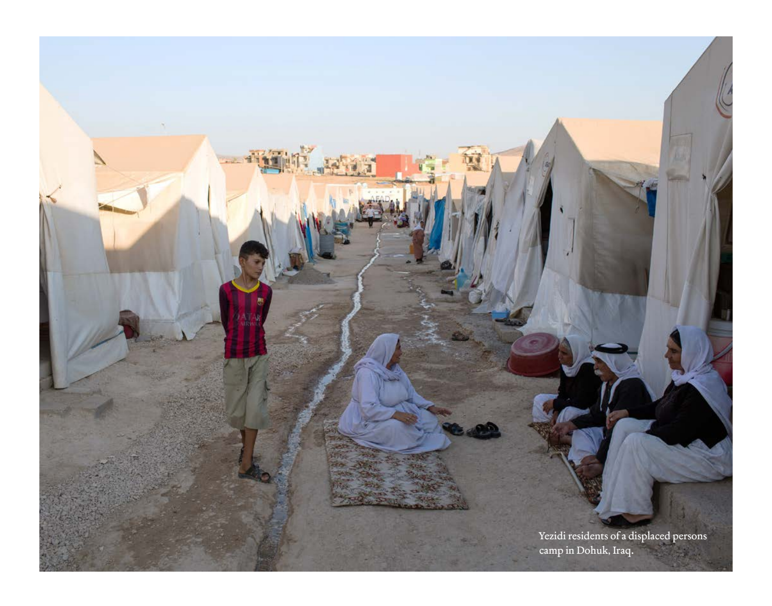
"There is no humanity— it was like they were killing chicken or sheep." —Yezidi woman in Shariya internally displaced persons camp

In the summer of 2014, the self-proclaimed Islamic State carried out a violent campaign against civilians in Ninewa province in northern Iraq, home to many of Iraq's ethnic and religious minorities. As the Islamic State (IS), known locally as Daesh, and affiliated groups attacked cities, towns, and villages, they forced more than 800,000 people from their homes and deliberately destroyed shrines, temples, and churches. They also kidnapped thousands and killed hundreds, likely thousands, of people. In less than three months, IS decimated millennia-old communities and irrevocably tore the social fabric of the once-diverse region. Now almost no members of the minority groups IS attacked live in Ninewa province.