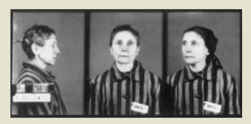
State Museum Auschwitz, Oswiecim, Poland