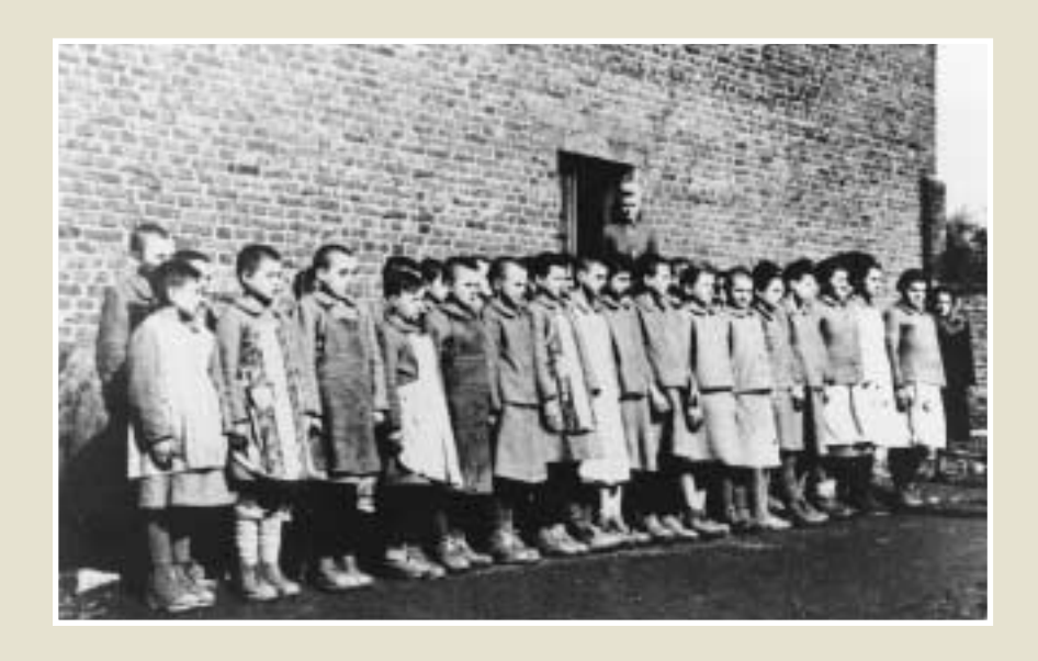
Main Commission for the Investigation of Nazi War Crimes, Warsaw, Poland